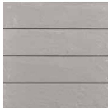
Bricklane Total Grey