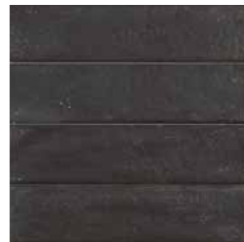
Bricklane Total Black